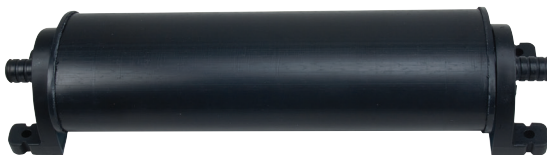
Without Heat Shield

Hose clamps must used in accordance with ABYC Fuel System Vent Hose Clamping Standards (H24 Table 3). The clamp must not distort the fitting on the canister when tightened. Leak test system per CFR33 requirements. Canister may not be pressurized to more than 5 psi.